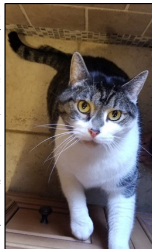
Osgar the cat. 18 pounds of love.