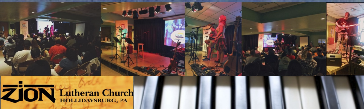
ZION Lutheran Church HOLLIDAYSBURG, PA